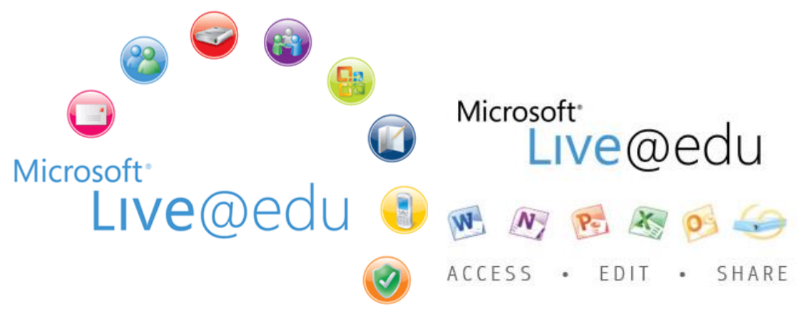
Figure 1. Integration of cloud platform Microsoft Live @ edu with various services and Microsoft software

1.1) Cloud platform Microsoft Live@edu (http://www.liveatedu.com) [11] provides opportunities for practical learning of known office applications through a web browser based on cloud technology.