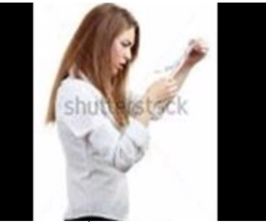
The 5<sup>th</sup> photo in the DS