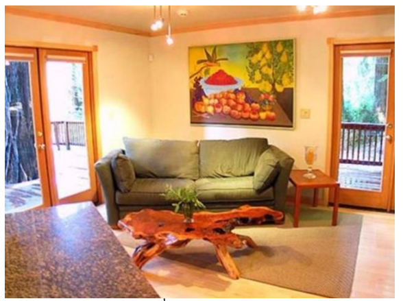
The 3<sup>rd</sup> photo in the DS

Another participant, S6, indicated having TK before the course and TPACK at the end of the course. She studied the importance of electricity. In the first version of her DS, she described what life would be like without electricity. After the main character used electricity wastefully, she received a bill she could not afford to pay, and her electricity was turned off. She eventually sought help from her parents to pay the bill and learned to use electricity wisely. During the process, S6 only received feedback on her photo selection and story presentation. She had focused too heavily on some parts, and some photos did not represent the story, so she changed some photos and eliminated some details (See Figure 3 for screenshot examples of DS prepared by S6).