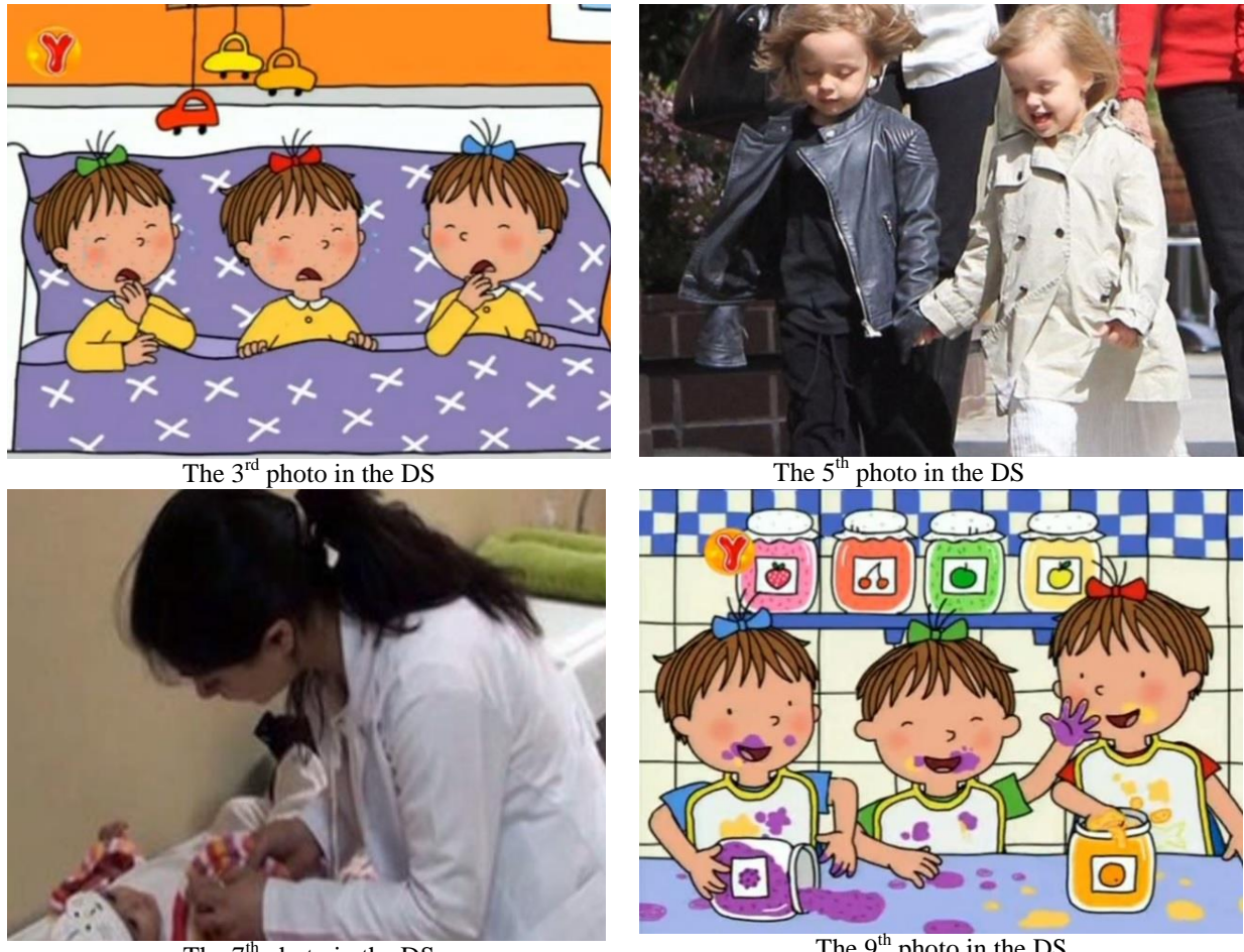
The 7<sup>th</sup> photo in the DS

soldiers; viruses won the war, peace was signed, and the viruses lived in the body and protected it. In this expression, she also failed to emphasize the role of white blood cells, indicating a lack of knowledge. During her preparation, she received feedback on these limitations, and in her final version, she corrected the issues (See Figure 2 for screenshot examples of DS prepared by S9).