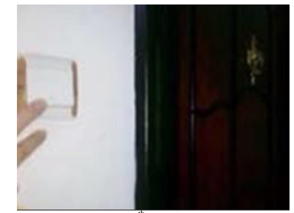
The 6<sup>th</sup> photo in the DS The 12<sup>th</sup> photo in the DS Note: The DS created by S6 consisted of 12 photos, and each part of the story was vocalized on these 12 photos. The following screenshots were the 3rd, 5th, 6th and 12th photos in the DS created by S9.

Figure 3. The four screenshots of DS created by S9