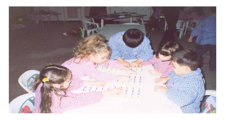
Fig.6. The application of these presentations idea pre-school institutions - 2