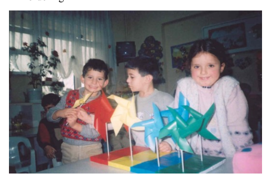
Fig.5. The application of these presentations idea preschool institutions - 1