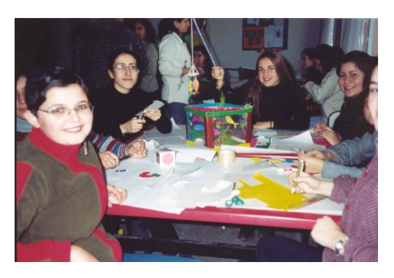
Fig.2. Doing group work and providing the preparation of