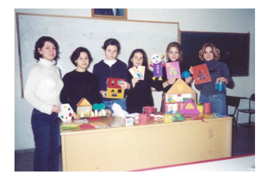
Fig.4. Creating opportunities for the groups to present the concrete materials