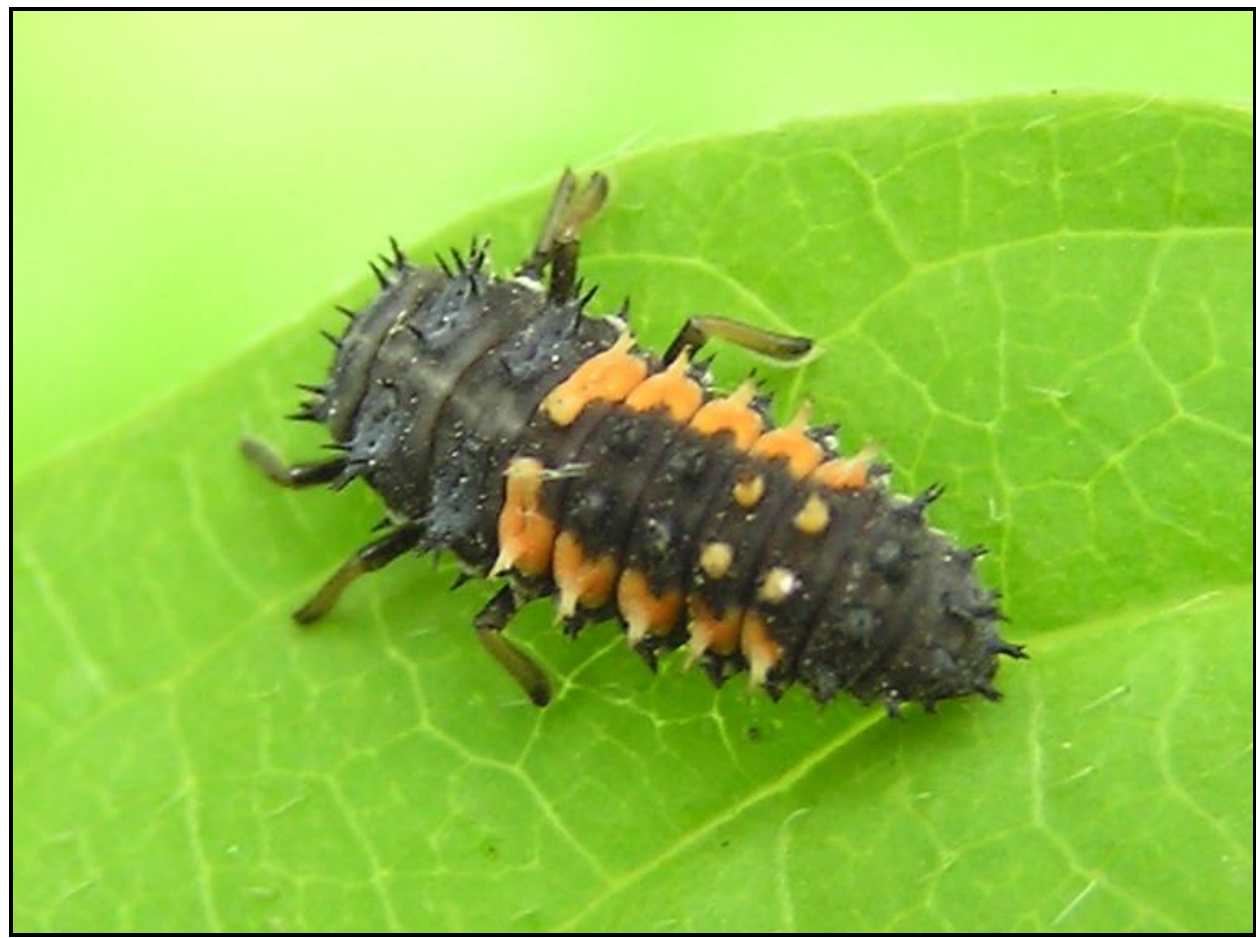
Photograph used with permission (Photograph by Derrick Ditchburn)