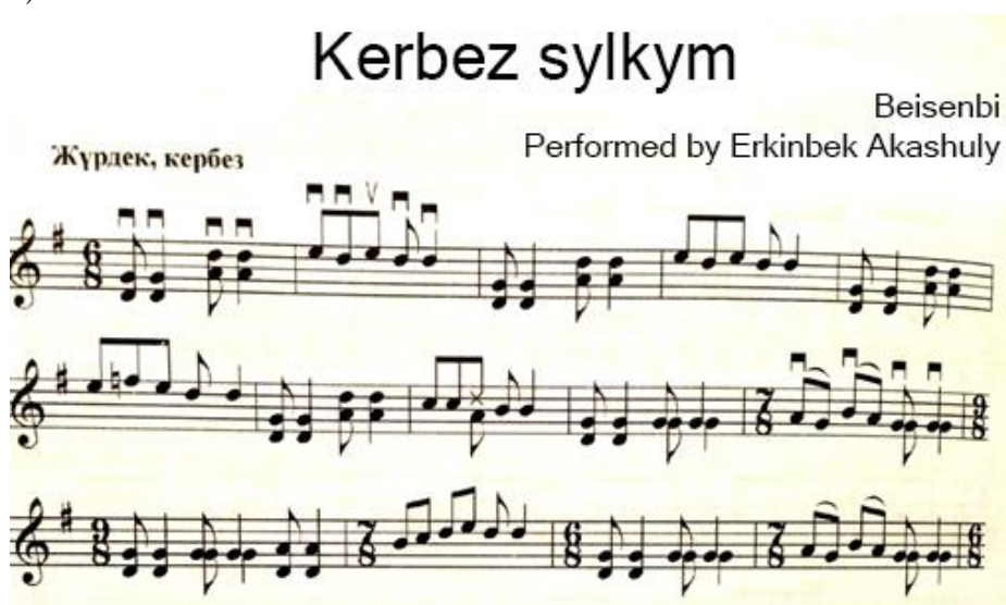
Figure 3. The kui «Kerbez sylkym»

This kui conveys a slight tremor and a light smile. It's as if the kui says: «How come? How is it that this maiden outwitted me? What a confident temper?! Oh, come, now! How did this happen to me?». The main theme here is the image of the maiden, and this image is conveyed by the author with a sigh and a light smile; the event that happened to him is colored in a color of a light smile. And we accept this kui as not just a kui, but a kui with the signs of a humor (Figure 3).