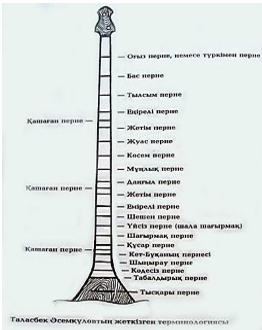
Figure 5. Terminology by T. Asemkulov

Below the fret “Кет Бұғаның пернесі” there is a «do» fret — «шыңырау перне». In ancient Turkic mythology the word «шыңырау» had two meanings. The first meaning of the word «шыңырау» is the lowest layer of three-layered universe (trichotomy). The second meaning of the word «шыңырау» is a bird performing the linking function between the phases of the great tree of universe. For example, the soul of a dead person reaches the higher branches of the tree on the back of this bird «шыңырау». In our opinion, «шыңырау перне» here means «the lower world». It seems that an inventor of the instrument decided it to be the lowest fret. However, as the time passed, the tastes of the people changed and kui range required the frets lower than «шыңырау». Thus, dombra fretboard was added one more fret «табалдырық перне». It is a music note «re» placed in the bounds of modern dombra’s fretboard and the body. This was not