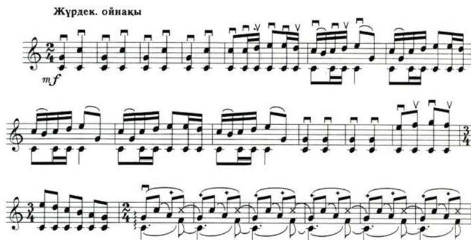
Figure 4. Musical notes of the kui «Nauysky».

There is a lack of information about dombra instrument. This two-stringed instrument has lots of sides and facets that are not yet revealed. This figure shows the structure of dombra (Figure 5).