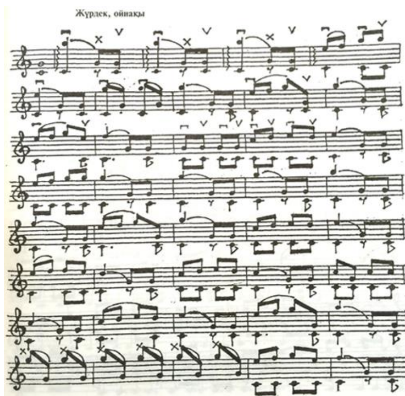
Figure 1. Musical notes of kui «Zhanyltash saikal»

As for the indecent style of kuis, the kui performer used several slurs to continuous free string as a zhanyltash, and in-between he indicated the maiden's shameful part with the finger of his right hand accompanied by the melody; this demonstrates indecent sides of badik kui. The main objective is victory. One more thing to point out, the kui is performed in front of the folk. It aims at completely different target. Let's try to explain. If these two kui performers contested without the witnesses, in an intimate environment, this would take a different nature, but this kui is performed in front of the folk, and is mainly aimed at cheering up the listeners, at demonstrating his mastership and wit. So, from this point, it acquires a different nature. For example, djigit's hopelessness, his «surrender to a girl» considered to be shameful for djigit in Kazakh nation. There is a saying goes: «Байтал шауып, бәйге алмас» (A mare cannot win the prize if contesting with a racer); so, if a dzhigit surrenders to a girl, he is considered worthless. One more major point to consider: this kui demonstrates Kazakh education, particularly the education of a girl. No matter how great a performer she is, her refusal to repeat the dzhigit's actions though she could do it, and her embarrassment indicates Kazakh girls' strong decency. Once more we prove our interest in Kazakh kuis by seeing ethical and aesthetic sides of these kuis.