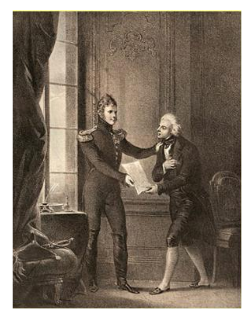
Figure 2. Earl SP Rumyantsev received from Alexander an order for the release of the peasants. Engraving the beginning of the XIX century.