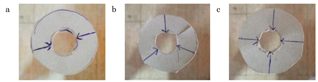
Figure 2. Cardboard stencils used to mark 180°, 120° and 90° angles on atoms to develop connecting pads.

A ring shaped cardboard stencil was used to identify the places to insert the back cap to develop the atoms with multiple valences as shown in Figures 02. Atoms with four bonds connected in tetrahedral orientation was developed using a piece of cardboard created to represent the bond angle of 109.5°. Atoms with six bonds in octahedral arrangement was developed using the cardboards stencil shown in Figure 03.