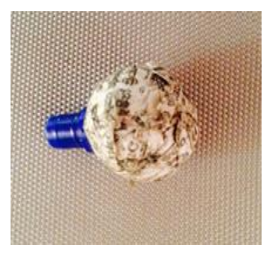
Figure 1. Hydrogen atom developed using waste paper with one connecting pad made with one back side cap of an empty ballpoint pen.

connect the cap firmly to the object. Developed hydrogen atom is shown in Figure 01. Finally the object was wrapped with white tissue papers to provide the correct color of the hydrogen atom.