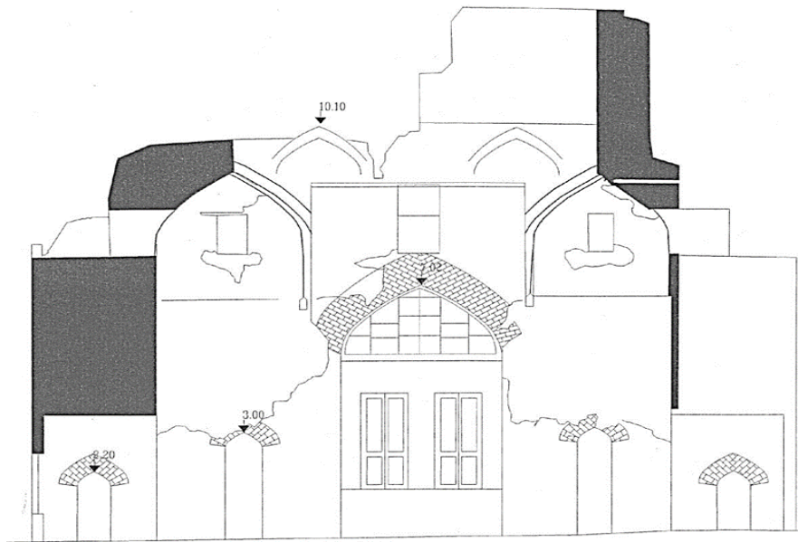
Figure 4. Design of Ardebil Jame Mosque, Architectural Details of Dome home's courtyard [2; Documents of Iranian Cultural Heritage Organization with some changes].