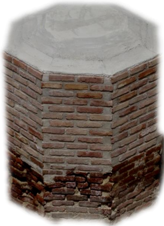
Figure 5. Ardebil Jame Mosque, Polyhedron circular columns [2].