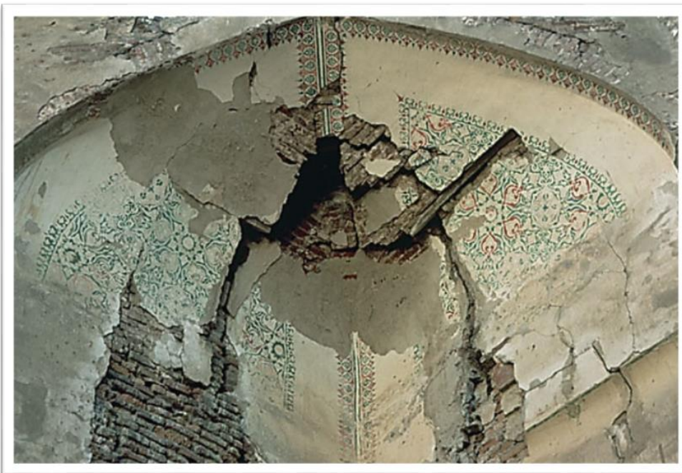
Figure 2. Ardebil Jame Mosque, Dome home's internal space ornaments.

While the present volume and all over the porch and dome home have been a large collection that the age's events turned their different compartments into a mass of soil and limited this majesty within an uncoordinated volume as much as 20*30 meters that the last floor belonging to hegira 9 th century is about 10 meters in height, it is not clear yet which reasons caused the bedchamber and porch to be overthrown.