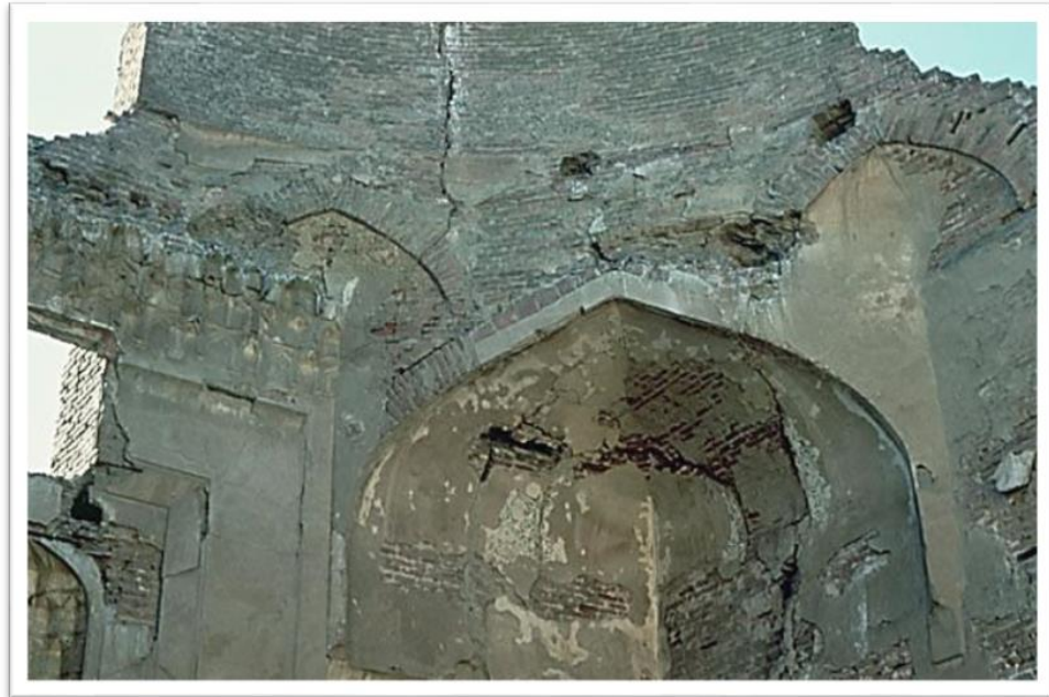
Figure 1. Ardebil Jame Mosque, Dome home's internal façade.