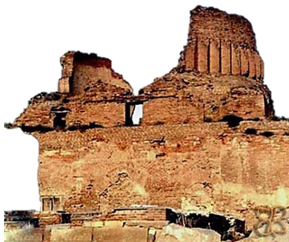
Figure 7. Ardabil Jame mosque, brick Dome home.

With documentation of written evidences and its external magnificence, competitive with majesty of internal space, it sounds that this dome home has been very large and elevated in its own prosperity period. However, what have left from present dome home are just two incomplete arch- shaped sections of outer crust and small part of inner crust tore in four high corners of bedchamber walls (figure 7).