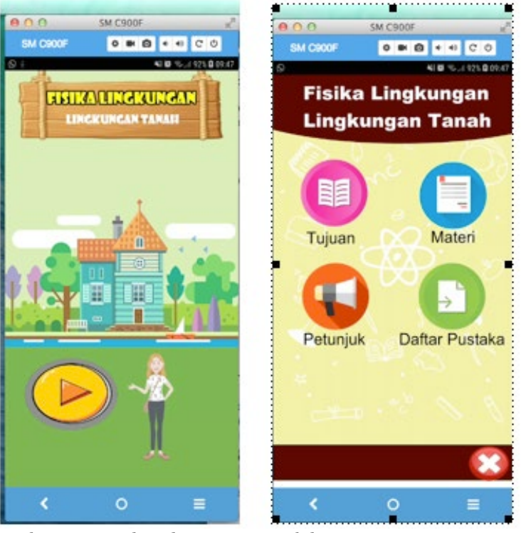
Figure 2. Display of teaching material applications via mobile

study materials is arranged in the form of teaching materials in the form of modules and power points that can be easily accessed by students. In addition to printed teaching materials, students are also given teaching materials in the form of applications that can be accessed through mobile phones. Application of environmental physics courses as shown in Figure 2 .