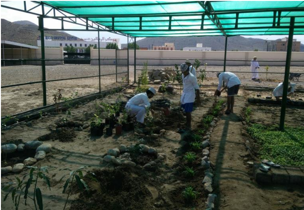
Figure 2. Grade 7 students preparing beds and planting school gardens.

In this phase, the researchers worked with each of the six selected schools to establish the gardens (Figures 2 and 3). Compost bins were also established in each school to provide an ongoing source of growing medium for each garden.