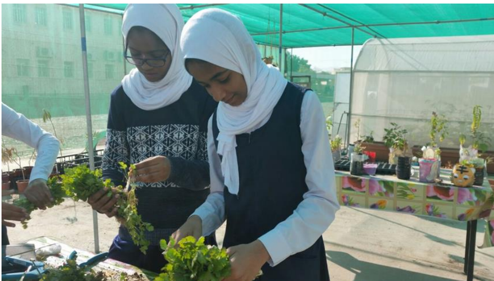
Figure 3. Grade 7 students sorting seedlings.