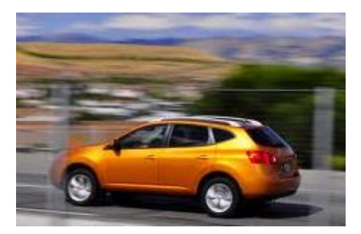
Figure 1. Picture for interview task 1