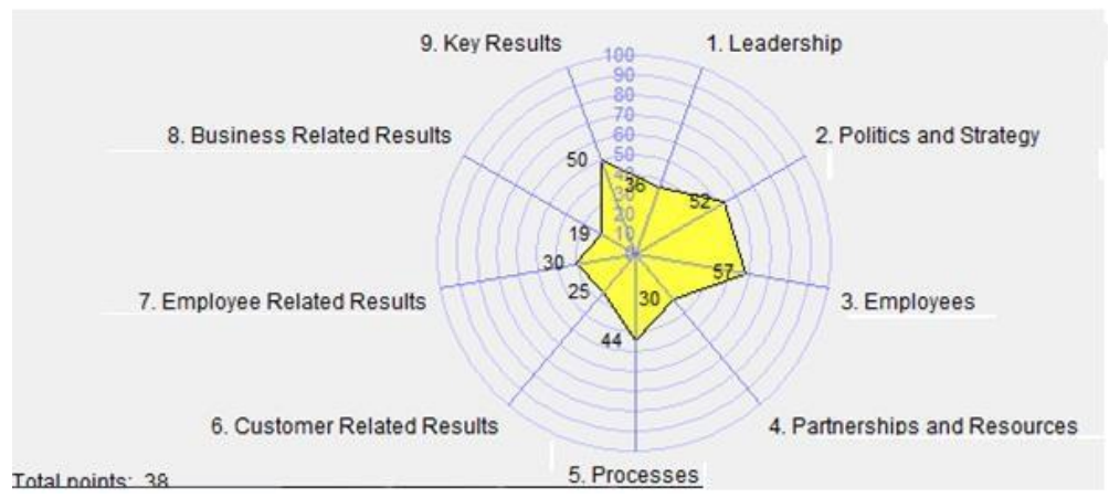
Figure 3. University activity results

The results of the University activity in relation to customers, staff, society and key performance indicators made using the computer program are presented as a chart in Figure 3.