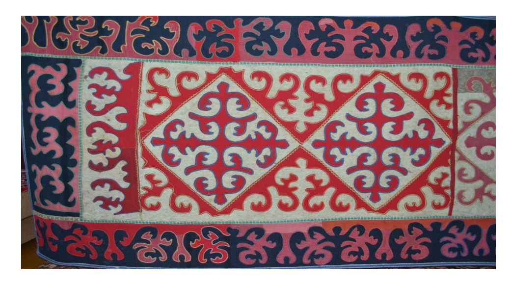
Figure 3. Tuzkiiz (application) 1960s. 141x168. Zhumabayeva Rakhiya. Central Kazakhstan

- tuzkiiz – wall carpet, made by sewing ornamental compositions on felt or solid color fabric – velvet or silk, and then sewing them to the felt basis, as shown in Figures 3 and 4.