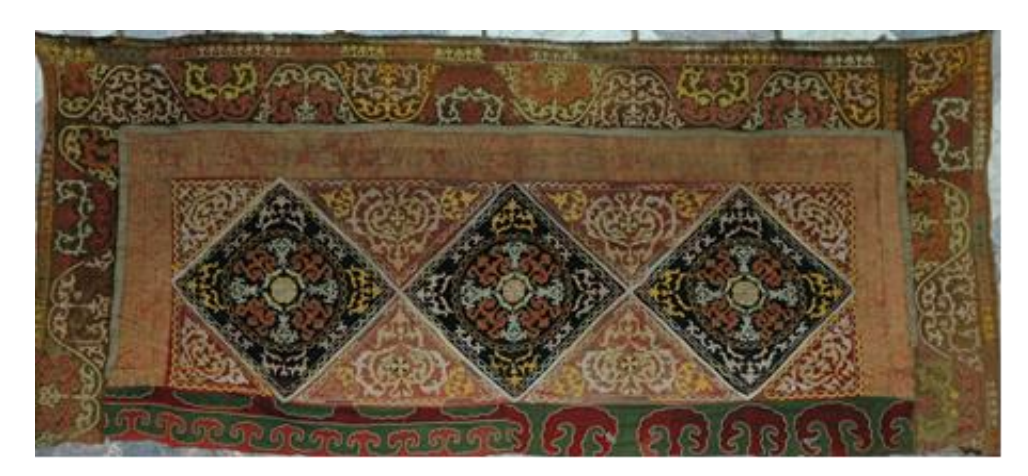
Figure 4. Tuzkiiz (sewing), fragment 1958. 90x158 Artisan. East Kazakhstan

The technology of making felt tekemet determines the specificity of the visual effects of its décor. During the felting of tekemet, the woolen pattern of one color penetrates the basis of a different color. Therefore, the structure of fibers in the two parts of the tekemet does not have a distinct border. Colors merge into each other, while the point of contact of their parts is somewhat indistinct. The ornamental tradition of the Kazakh felt floor tekemet is characterized by a schematic nature of the big ornament and its free arrangement. The main ornamental motifs used in this felt are squares and rhombs with cross-shaped figures and framing in the form of a wave or meander.