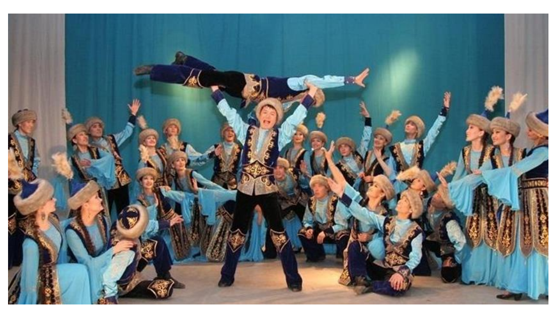
Figure 4. Folk dance "Utys bi" (contest dance-) in the performance of the State Dance Theatre "Naz"

L.P. Sarynova (1976), who studied the Kazakh national dance, the author of numerous books on the art of Kazakhstan, wrote: "The old folk dances, which traces were found, were not the "rudiments of a primitive dance or their elements; they presented the original dance art, which distinctive means were determined by the culture of a patriarchal-feudal society".