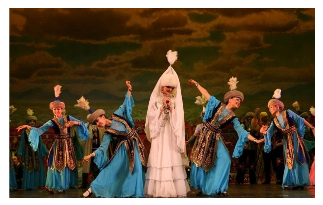
\begin{tabular}{lll} Figure 3. The Kazakh wedding dance "Koshtasu" performed by the State Dance Theatre "Naz" \\ \end{tabular}