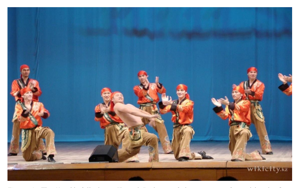
Figure 2. The Kazakh folk dance "Buyn bi" (dance of the joints) performed by the State Dance Theatre "Naz" \,