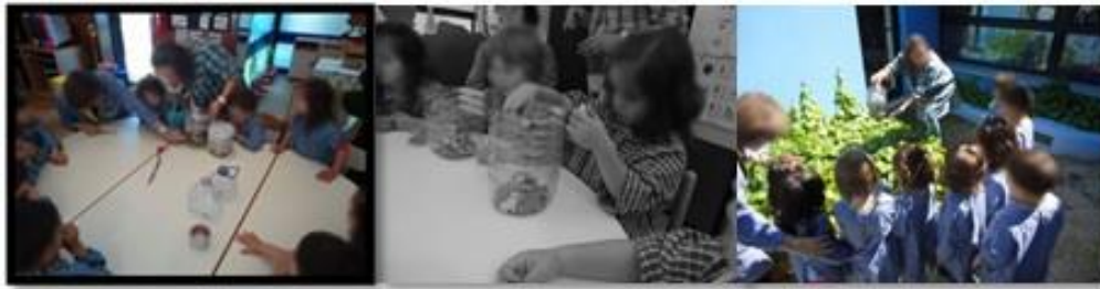
Figure 4. The little digesters.