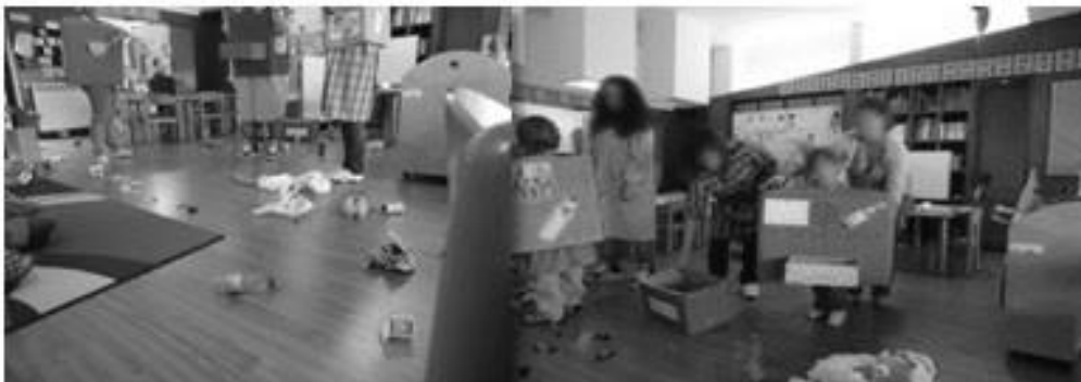
Figure 2. The eco-colorful.

The kindergarten educator, along with the kindergarten educator student, performs a play for the group of children on the theme recycling bins (Figure2).