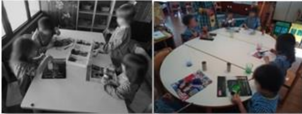
Figure 3. Recycling Train: building toys.

Through painting, stamping, collage and creativity children reused some waste/ rubbish and built their toy (Figure 3).